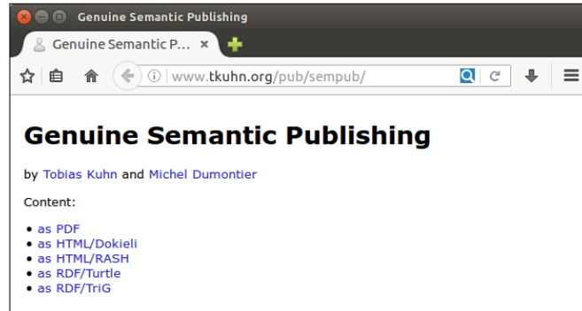
Figure 2. The landing page pointing to different versions of the work.

Specifically, we link to the PDF version of this work, two flavors of HTML (Dokiel and RASH), and RDF representations in Turtle (without provenance information and metadata) and TriG (with provenance information and metadata in the form of nanopublications), thereby also showcasing how existing technologies can contribute to achieve genuine semantic publishing.